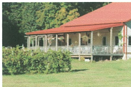
Butler Winery opened in 2008, making it one of the newest wineries in Indiana. Indiana Wine Grape Council

With the possibility of 10 new wineries opening in late 2009 and 2010, many in the northern and north-central parts of the state, it is possible that Indiana may welcome a fourth wine trail in the next year or two.